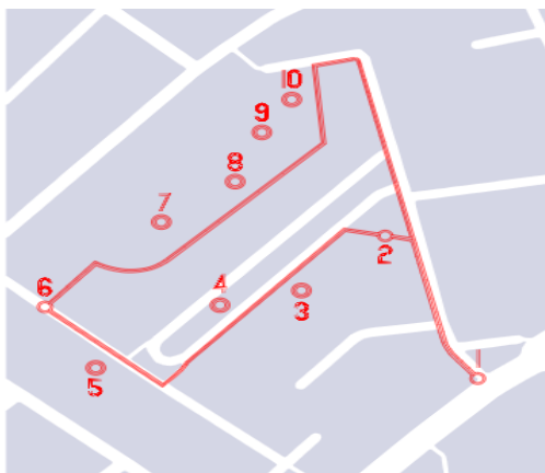
Map of proposed Walking Tour featuring points of Interaction - est. 400m distance.